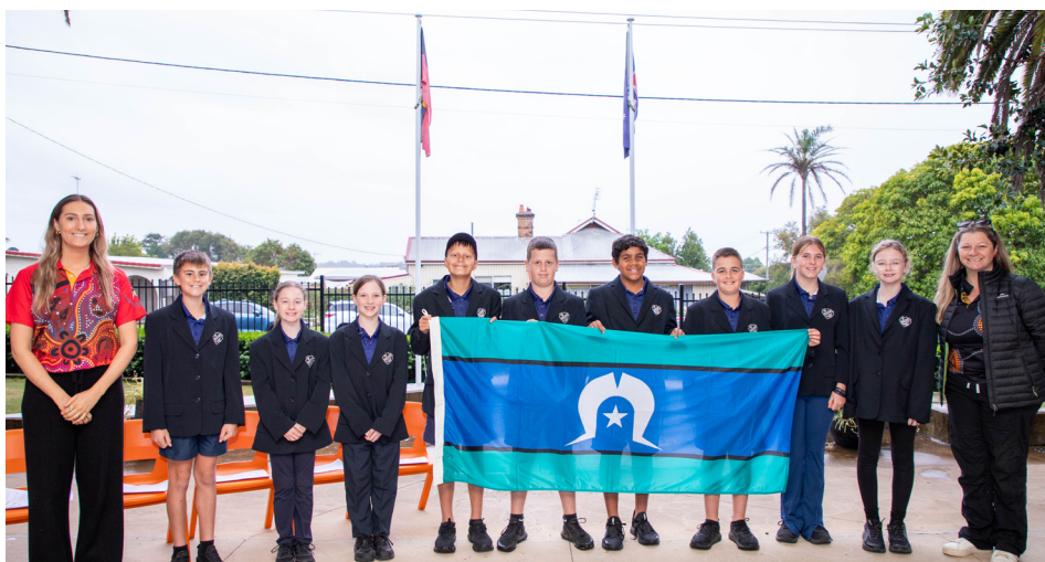
NAIDOC Flag Raising Ceremony