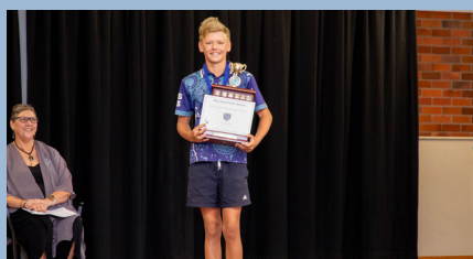
Nanga Mai Award