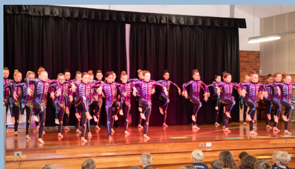
Stage 2 Dance Group