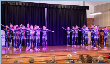
Stage 2 Dance Group