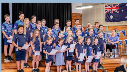
Stage 2/3 Choir