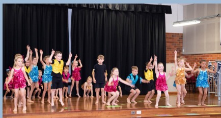
Kindergarten Dance Group