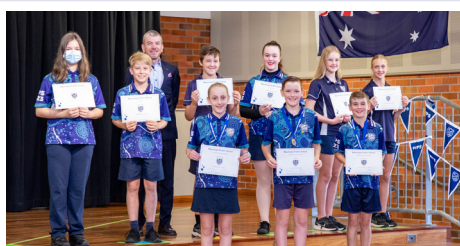
Class - 5/6JE