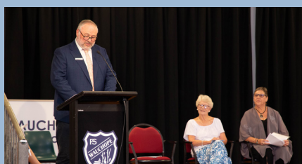
Mr Osborne's Speech