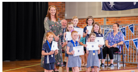
Class - 2MM