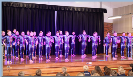
Stage 2 Dance Group