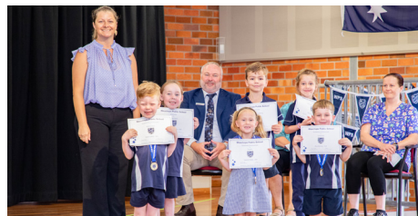
Class - KLR