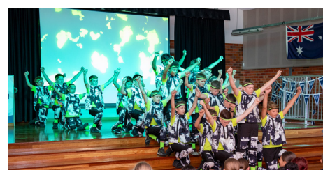
Boys Dance Group