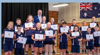
Sports House Captains 2024