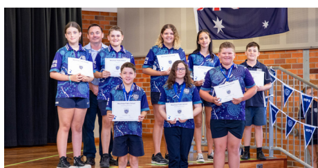
Class - 6DB