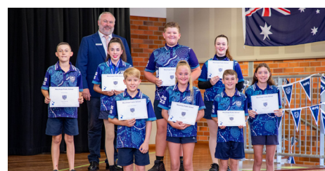
Outgoing School Leaders