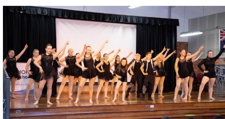
Stage 3 Dance Group