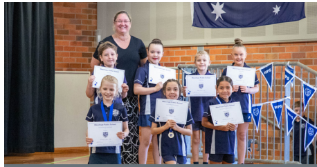
Class - 3JH