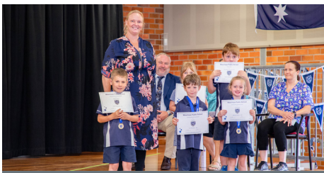
Class - KJL