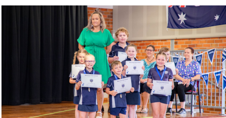
Class - 2MT