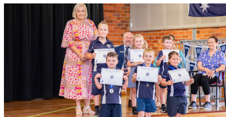
Class - 1LF