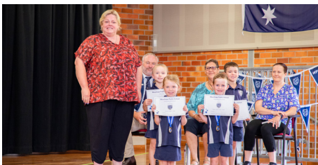
Class - KVV