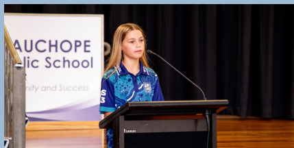
Acknowledgement of Country