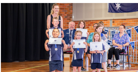
Class - 2JC