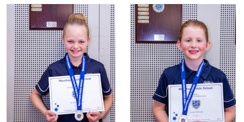
Major Award Winner