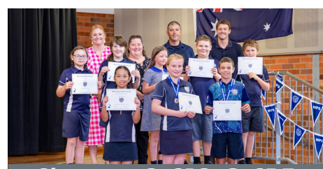
Classes - 3-6JG, 3-6RF, K-6RT