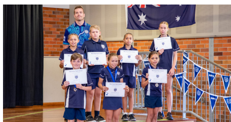
Class - 5CG