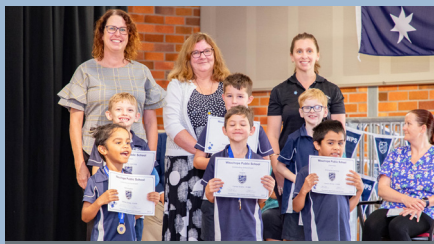
Classes - K-6AP, K-6BC, K-6SR