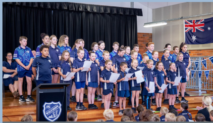
Stage 2/3 Choir