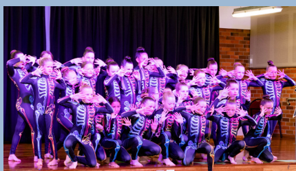
Stage 2 Dance Group