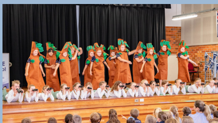
Stage 1 Dance Group