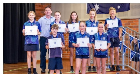
Class - 6JS