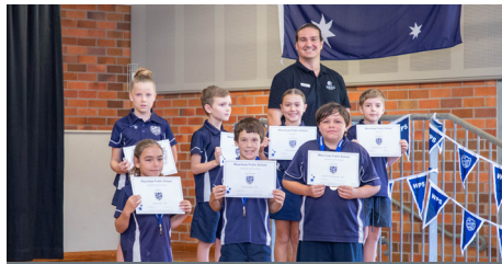
Class - 3SS