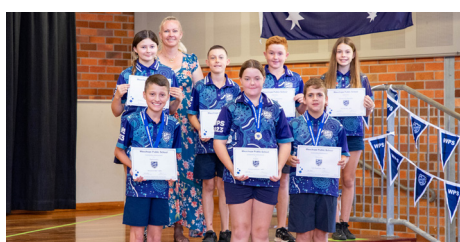
Class - 6MU