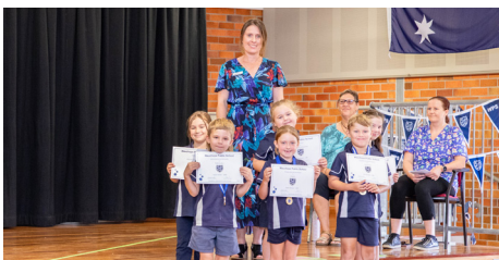
Class - 1MB