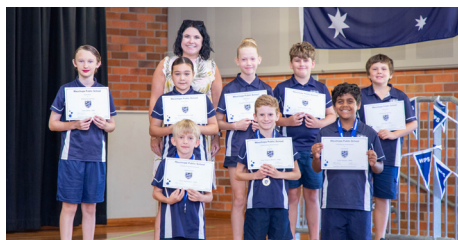
Class - 4NW