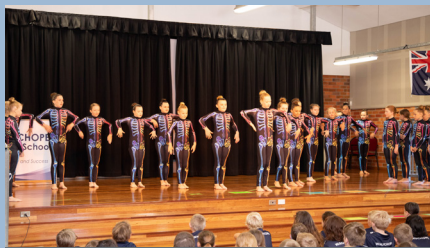
Stage 2 Dance Group