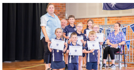
Class - 2MH