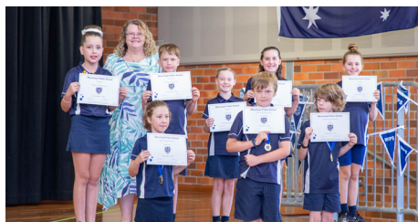
Class - 4MH