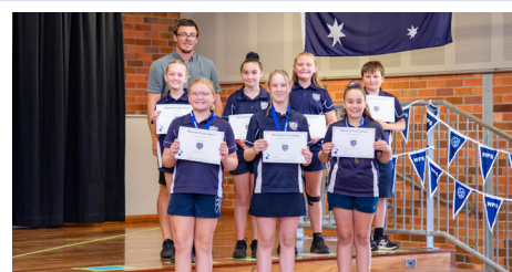
Class - 5AL