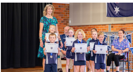
Class - 1JB