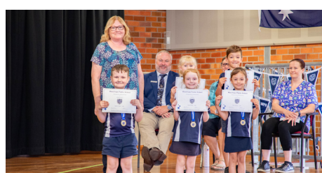
Class - 1KB