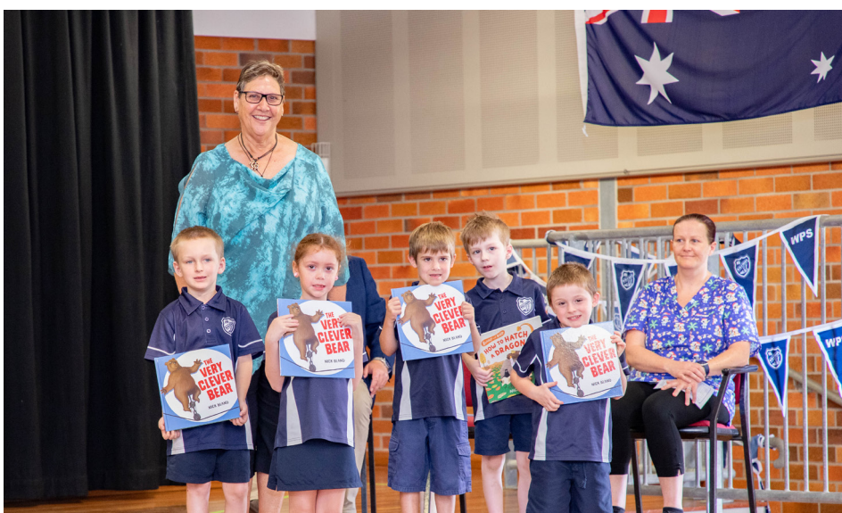
Reach for the Stars