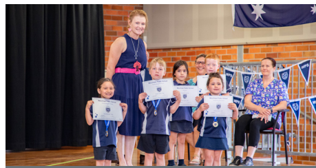
Class - KSS