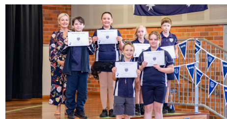
Class - 5CR