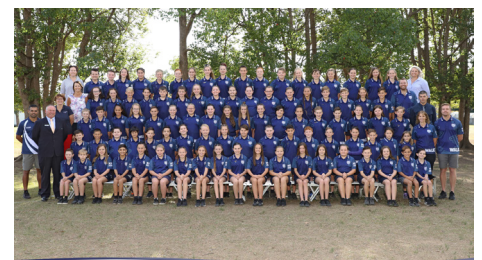
Wauchope Public School Year 6 - 2019