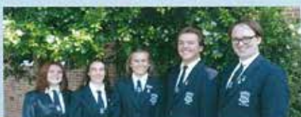
Wauchope High School Leaders