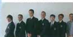
Mock Trial Team